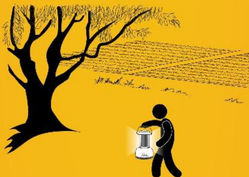
Use in Field / Home / Shop